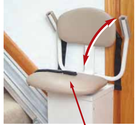
Hand-held pendant controls come standard with folding arm seat.