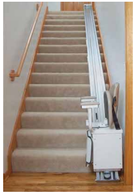
Our lift folds to within 14" of the wall when not in use, and the track is only 11.5, leaving plenty of room for foot traffic.

Unlike other manufacturers, AmeriGlide Lifts provide you with the choice of two convenient power options. Choose between safe, AC electrical operation (low voltage, 24V controls), or add protection against power outages by using our DC battery operated system. Unlike other units, our DC battery operated unit continually recharges regardless of its position on the track. This eliminates the need for you to remember to park the lift on charging pins or to make sure it is in a charging zone.