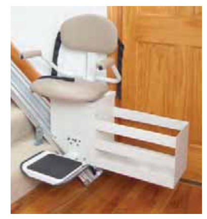
Use the optional side-car basket to carry groceries, laundry and other items up and down stairs.

Optional folding arms fold up to create more room on the stairway. Their height is easily adjusted to accommodate different sized people.