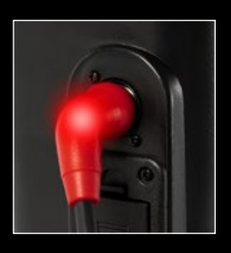
Exclusive Charge360 magnetic charger